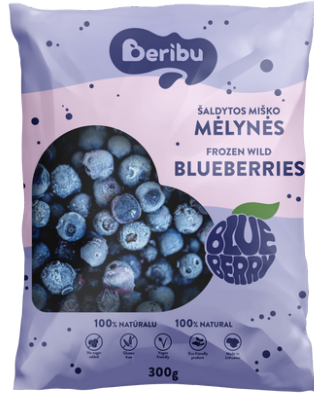
"BERIBU" 300G BAGS